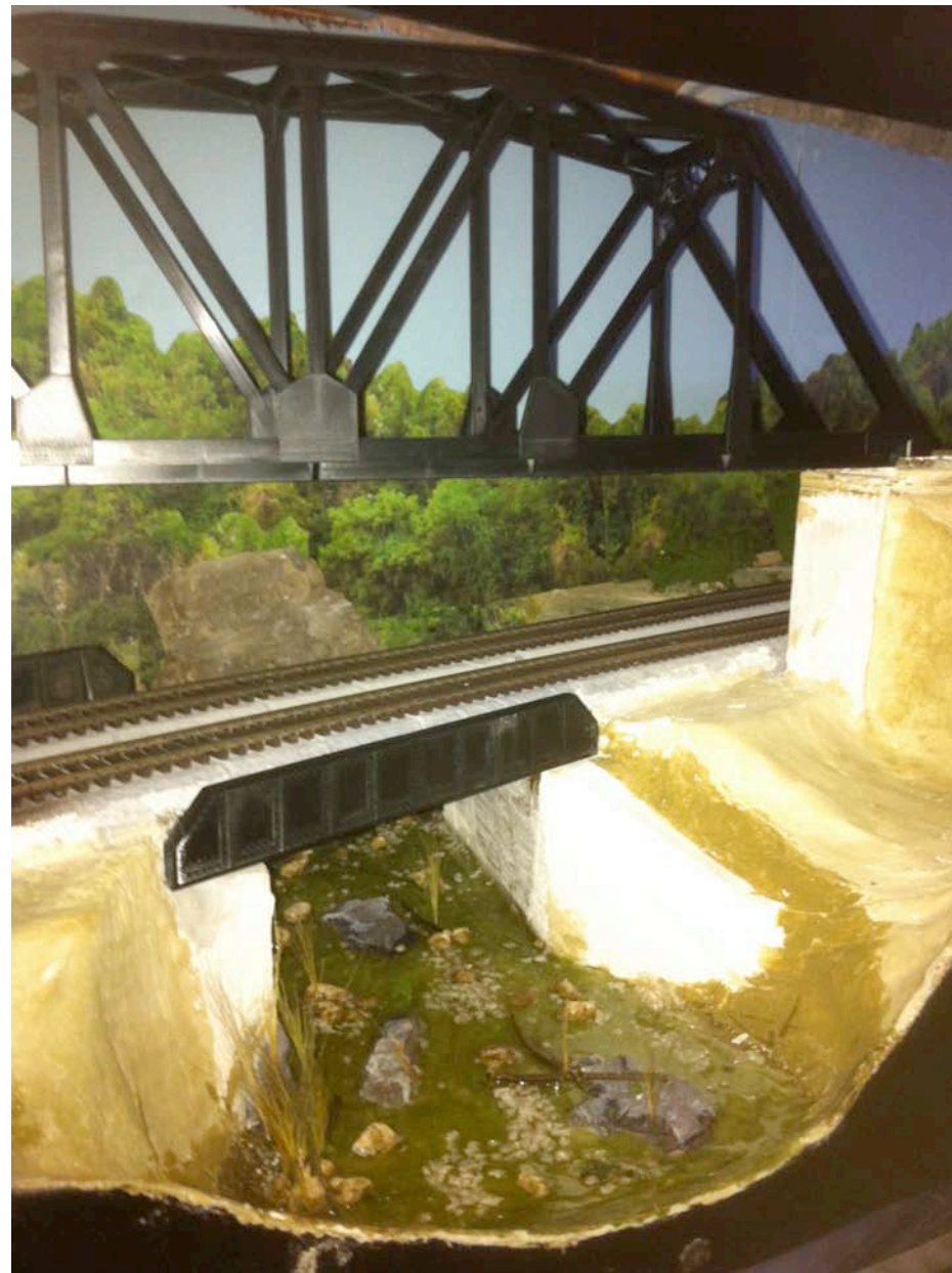
Scenery is under way on the editor's Reading Lines