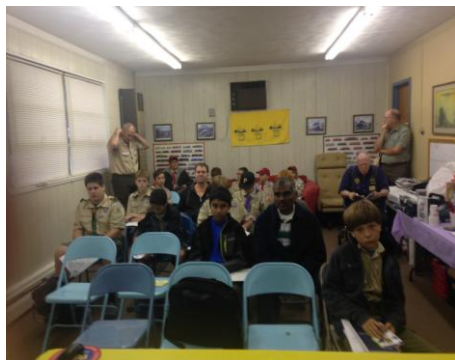
Scouts and leaders arrive for the Railroading Merit Badge class given by the First State Model Railroad Club on October 11, 2014

Nineteen scouts registered for the class between April 20 and October 10, 2014. The class was listed on the Delmarva Council calendar and also on various District calendars.