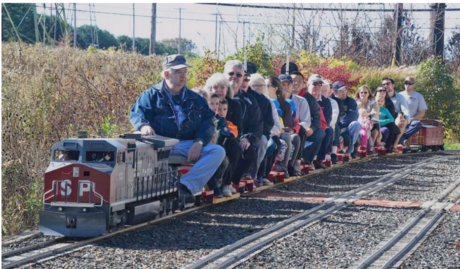
Pennsylvania Live Steamers visit... Can you identify division members?