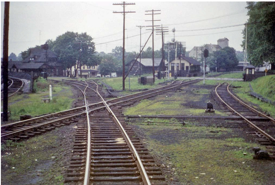
Vintage photo of RDG/PRR crossing in Birdsboro, PA