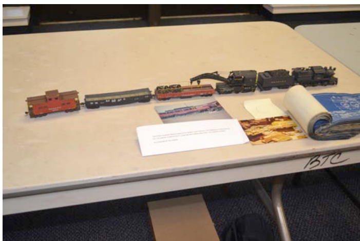
Winning entry in the model contest