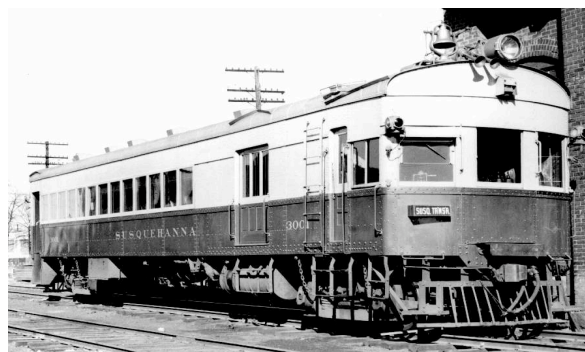
NYS&W Doodlebug 3001